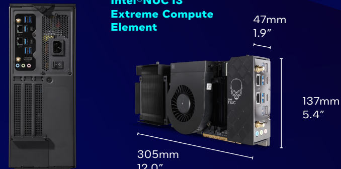
Intel® NUC 13 Extreme Compute Element